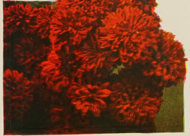
EARLY CRIMSON. 60c each; 3 for $1.50